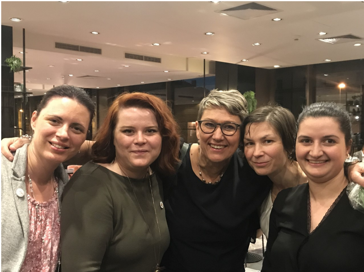
Developing cancer nursing together with the help of EONS in the Czech Republic!

Every year on 18th May, we celebrate European Cancer Nursing Day – our excellent work, empathy, knowledge, kindness and strength. It's pretty heavy work sometimes, isn't it? But we all love it and we are cancer nurses from the depths of our soul and heart because this field of medicine can't be done without it.